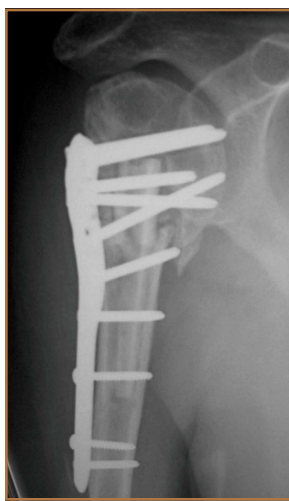
Figure 1. Anteroposterior radiograph of right shoulder 9 months after open reduction and internal fixation of proximal humerus fracture with locked plate and intramedullary fibular allograft. Humeral head has subsided with resultant intra-articular screw penetration of glenohumeral joint.

A widely adopted technique for neutralizing rotator cuff-deforming forces, which theoretically can cause fracture displacement, is incorporation of heavy nonabsorbable sutures.