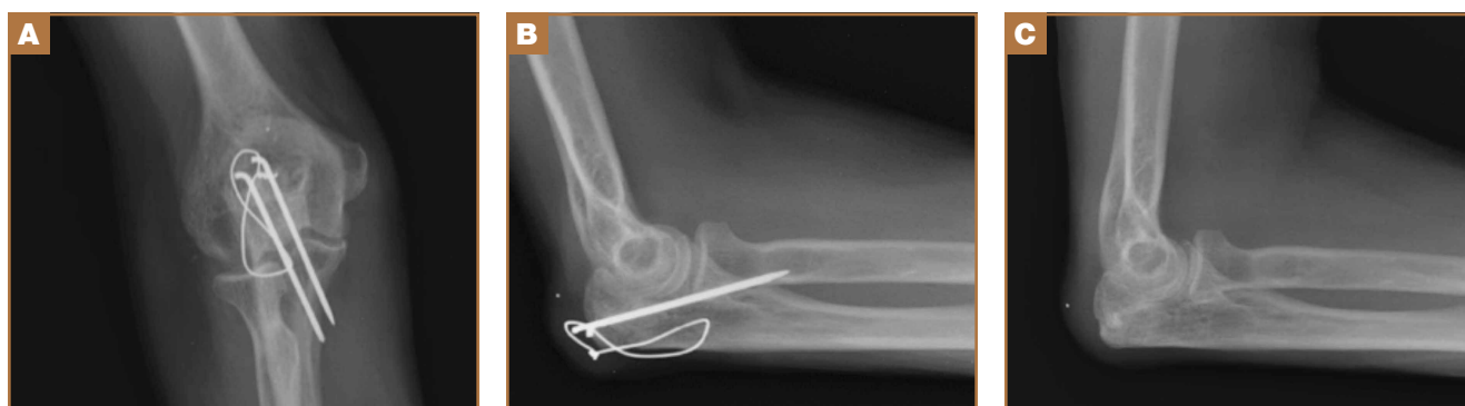
Figure 2. (A) Anteroposterior and (B) lateral radiographs of tension-band wire that disengaged from longitudinal Kirschner wires. (C) Radiograph after removal of implant because of prominence.

fections in either group. Overall, there were no statistically significant differences in complications between groups.