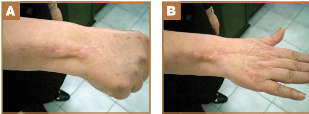
Figure 3. (A) The wrist deformity has been corrected, (B) with full active extension of fingers.

by suturing it side to side to the muscle and tendon of the extensor indicis proprius (Figure 2).