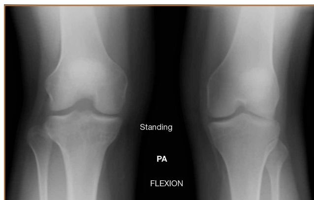
Figure 1. Anteroposterior view of both knees shows left knee valgus alignment with narrowing of the lateral compartment, narrow intercondylar notch, and hypoplastic tibial eminences and lateral femoral condyle.

Authors' Disclosure Statement: The authors report no actual or potential conflict of interest in relation to this article.