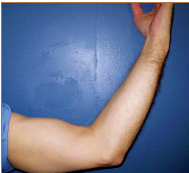
Figure 4. Patient positioned for test with hand in full supination; note biceps mass more proximally located in arm.

We have been using the supination-pronation test in our clinical practice for 2.5 years. In our experience, opportuni-