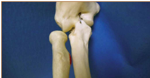
Figure 3. Posterior-lateral view of forearm in full pronation; note posterior position of biceps insertion in red.