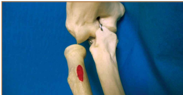
Figure 2. Forearm positioned in neutral; note movement of radial tuberosity, with biceps insertion in red.