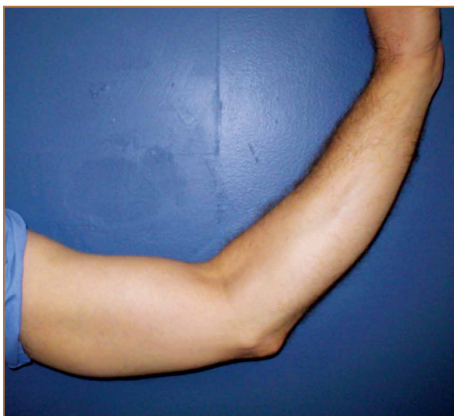
Figure 5. Patient moves to position arm in full pronation; note distal change in biceps position.