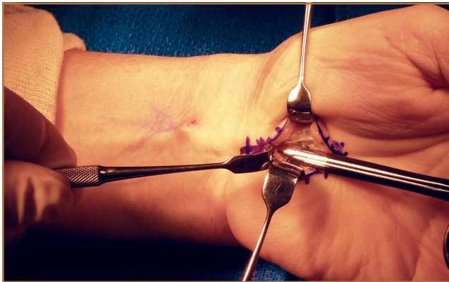
Figure 2. Mobilization of subcutaneous fat above transverse carpal ligament is performed using curved Mayo scissors.