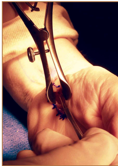
Figure 4. Long-handle scalpel is used to incise transverse carpal ligament and distal volar forearm fascia under direct visualization.

We perform OCTR under tourniquet control. Choice of anesthesia is surgeon and patient preference. We prefer local anesthesia with conscious sedation. After conscious sedation is administered, we infiltrate the carpal tunnel and surrounding subcutaneous tissue with 10 mL of a 50:50 mixture of 0.5% bupivacaine and 1% lidocaine without epinephrine.