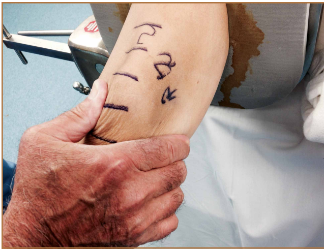
Figure 3. Examination of right knee with patient under anesthesia reveals medial subluxation at 30° of knee flexion.

Once MPS is suspected after a thorough history and physical examination, examination under anesthesia accompanied by diagnostic arthroscopy confirms the diagnosis. Lateral forces are applied to the patella in full knee extension and 30° of flexion (Figure 3). During arthroscopy, the patellofemoral compartment is viewed from the anterolateral portal. With the knee at full extension, the lateral laxity and medial tilt of the patella can be identified (Figure 4). As the knee is flexed