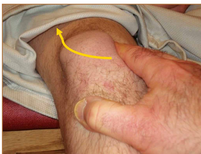
Figure 2. Lateral patellar float sign identifying lateral patellar laxity.