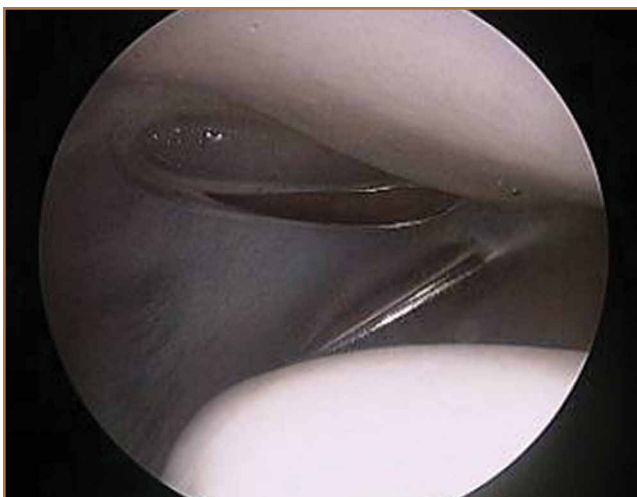
Figure 4. Arthroscopic picture of patellofemoral compartment (right knee) viewed from anterolateral portal shows lateral patellar laxity at full knee extension.