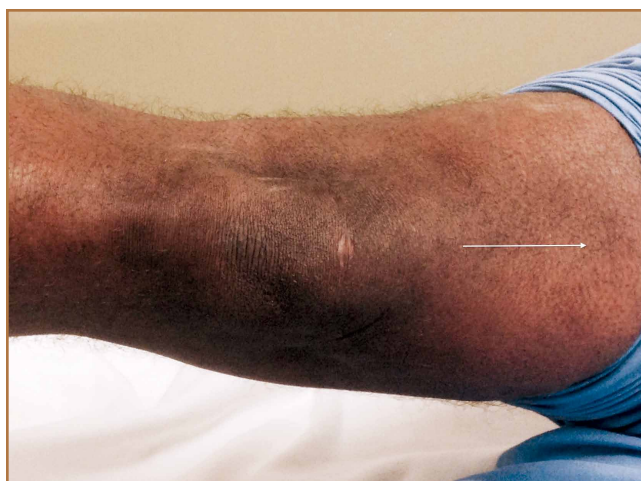
Figure 1. Right knee of patient in left lateral decubitus position. Leg is passively abducted by examiner with quadriceps relaxed and knee extended. With active quadriceps contraction (white arrow), patella is pulled back into trochlea. This is the negative gravity subluxation test.

Patients with MPS often have lateral patellar laxity (LPL), which allows the patella to rotate upward on the lateral side and skid across the medial facet of the femoral trochlea. A physical examination sign combining lateral patellar glide and tilt was described by Shneider 24 to identify LPL. This “lateral patellar float” sign is present when the patella translates laterally and rotates or tilts upward with medial pressure on the patella (Figure 2). Another maneuver to test for subtle MPS involves manually centering the patella in the trochlea during