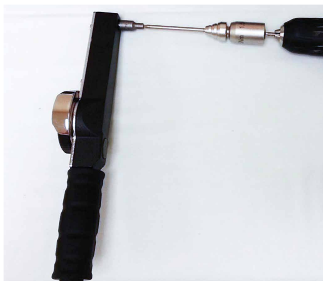
Figure 2. Experimental setup: Synthes torque-limiting device with Star Drive attachment attached to Craftsman C3 drill.