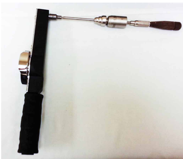
Figure 1. Experimental setup: Synthes torque-limiting device with Star Drive attachment attached to quick-coupling wooden handle.

A torque-limiting event was defined as a single audible click on the torque limiter.