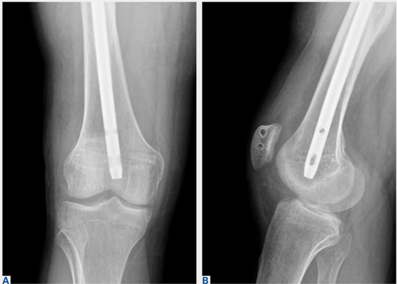
Figure 4. Postoperative standing (A) anterior-posterior and (B) lateral right knee radiographs show that the distal interlocking screw has been removed. The drill holes in the patella for medial patellofemoral ligament reconstruction can be seen on the lateral X-ray.