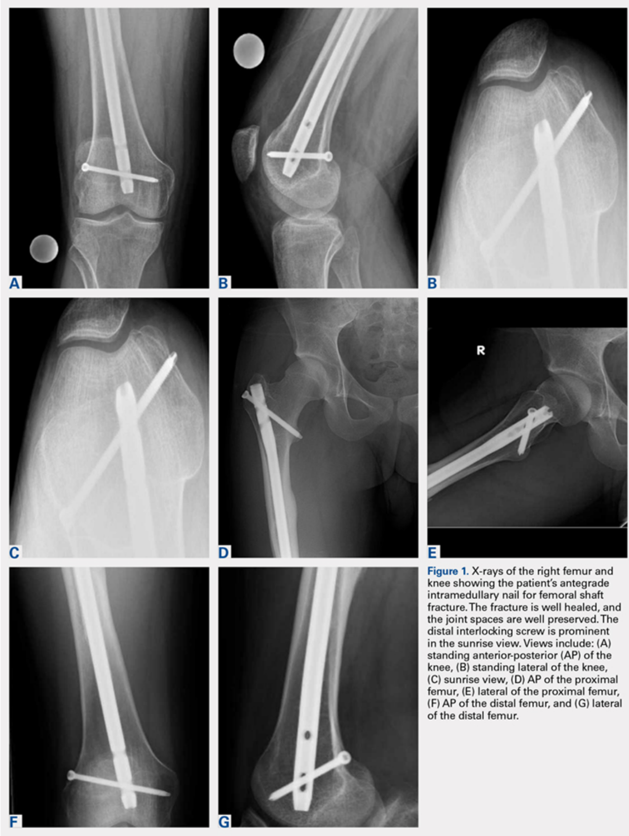
Figure 1. X-rays of the right femur and knee showing the patient's antegrade intramedullary nail for femoral shaft fracture. The fracture is well healed, and the joint spaces are well preserved. The distal interlocking screw is prominent in the sunrise view. Views include: (A) standing anterior-posterior (AP) of the knee, (B) standing lateral of the knee, (C) sunrise view, (D) AP of the proximal femur, (E) lateral of the proximal femur, (F) AP of the distal femur, and (G) lateral of the distal femur.