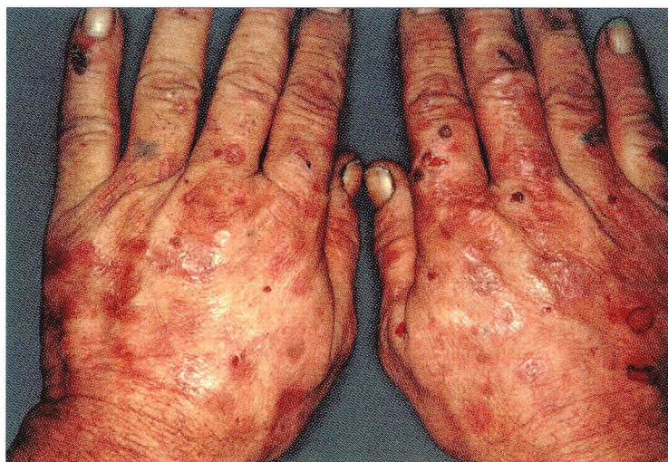
FIGURE 1. Skin lesions on hands, typical of porphyria cutanea tarda.

Sixty percent of patients with PCT have increased serum iron, and 60% have abnormal