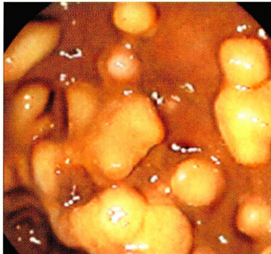
FIGURE 1. Colonoscopic view of pseudomembranous colitis secondary to Clostridium difficile .

The enzyme immunoassay is more common and practical for clinical use. It has a sensitivity of 70% to 95% and a specificity of 99% to 100%. 1 Sending more than one stool sample for enzyme immunoassay testing during the