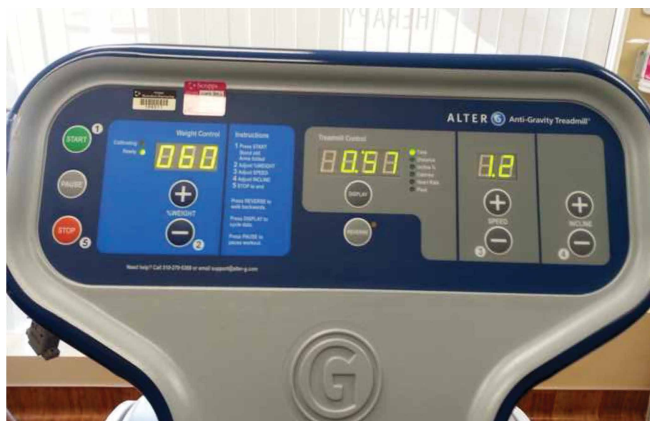
Figure 2. The AlterG® Anti-Gravity Treadmill® control panel.