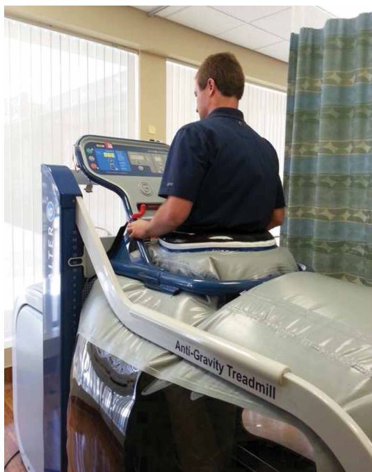
Figure 1. The AlterG® Anti-Gravity Treadmill®.

Patient demographics were similar between the control and AlterG groups ( Table 1 ). The control group comprised 9 women (60%; 9/15) and 6 men (40%; 6/15), age 69.9 \pm 7.8 years and a body mass index of 28.8 \pm 4.2 . Similarly, the AlterG group