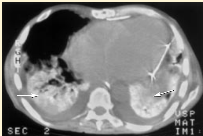
FIGURE 1. A computed tomographic scan without contrast in a patient receiving amiodarone reveals infiltrates in both lung bases (arrows), due to the iodine content in amiodarone. This enhancement, however, is not pathognomonic for amiodarone toxicity.