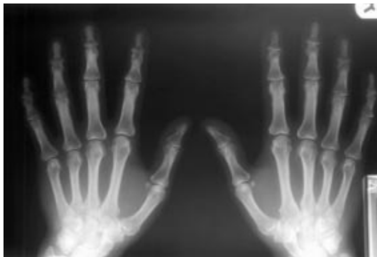
FIGURE 2. Top, this patient with hemochromatosis arthritis has symmetric arthropathy of second and third metacarpophalangeal joints with loss of cartilage and the formation of marginal beaked osteophytes (arrows). Bottom, in contrast, in this patient with osteoarthritis, mild osteoarthritis is visible in the distal interphalangeal joints of all fingers, especially the right second and third. There is minimal involvement of the right proximal interphalangeal joints.