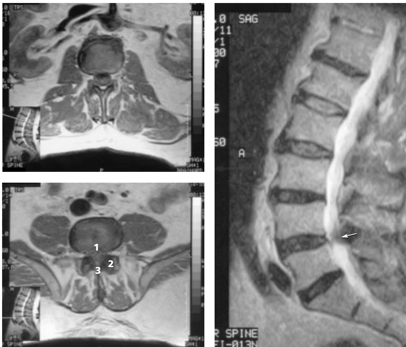
FIGURE 1. Magnetic resonance imaging (MRI) scans in a 75-year-old man. Top left , minimal degenerative changes at the L1-L2 level. Bottom left , severe lumbar canal stenosis at the L4-L5 level due to (1) disc degeneration, (2) facet hypertrophy, and (3) ligamentum flavum hypertrophy. Right , lateral view. Note the stenosis at L4-L5 (arrow).

mobility, with or without spinal canal stenosis. Extension is usually more limited than flexion. 10,11