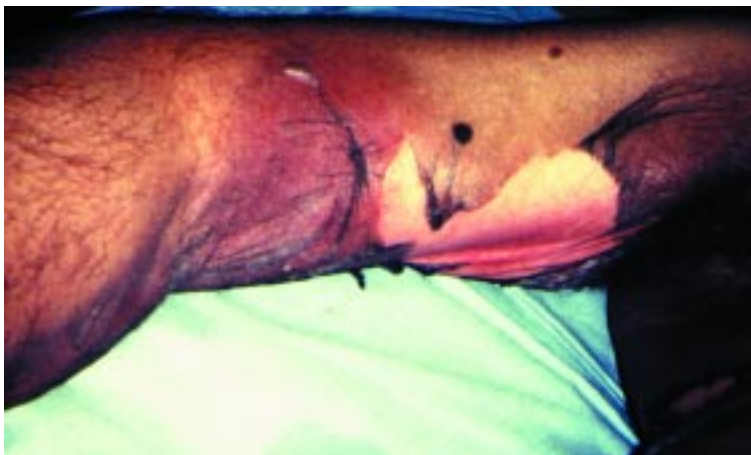
FIGURE 1. Toxic epidermal necrolysis. Epidermal detachment is characteristic of this entity. Mucous membranes, palms, and soles may be affected.