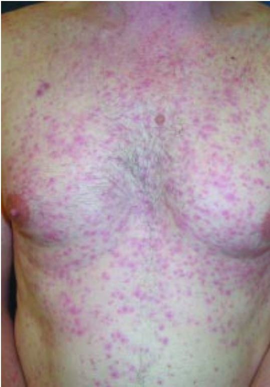
FIGURE 2. Maculopapular or morbilliform rash is the most common type of cutaneous adverse drug reaction. It usually involves the trunk and extremities, sparing the palms and soles.