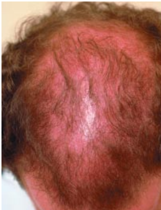
FIGURE 1. Top, male pattern. Bottom, female pattern.