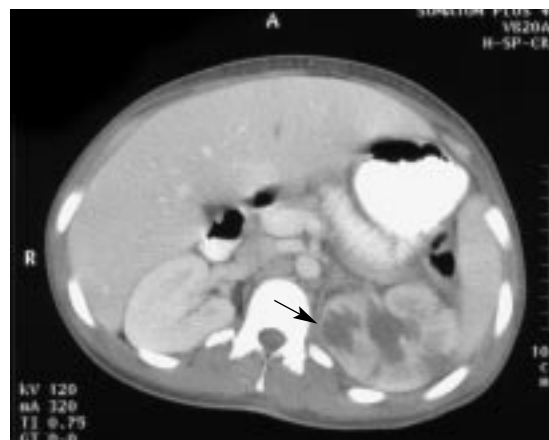
FIGURE 1. Computed tomographic scan showing left pyelonephritis and an intrarenal abscess (arrows).

use of a diaphragm clearly increase the risk of urinary tract infection.