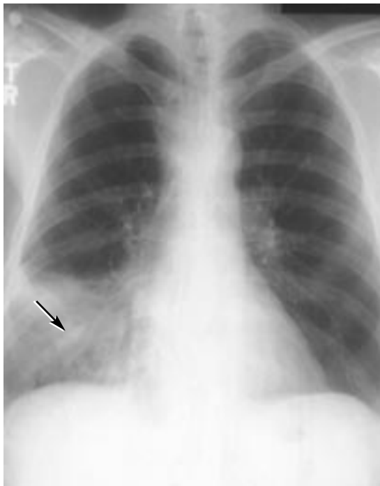
FIGURE 1. Right middle lobe infiltrate (arrow) in a man with systemic lupus erythematosus, fever, pleuritic chest pain, and dyspnea.

His hemoglobin level is 9.2 g/dL and falling