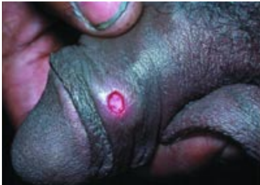
FIGURE 1. A classic syphilis lesion.

STDs in 2005, with 50% of Americans acquiring at least one by age 35. An estimated 20% of children have had sexual intercourse by age 14, and 25% of teenagers acquire an STD before high school graduation, regardless of their socioeconomic status.