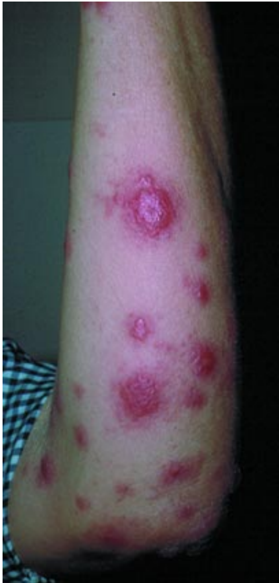
FIGURE 2. Secondary rash of syphilis in a patient with human immunodeficiency virus infection.

The secondary rash can resemble cutaneous lymphoma or psoriasis, with unusual indurated plaques and nodules (FIGURE 2). Simultaneous appearance of the primary chancre and the secondary rash is an almost certain indication that HIV is also present. The eyes or central nervous system may become involved earlier than normally occurs in patients with syphilis alone.