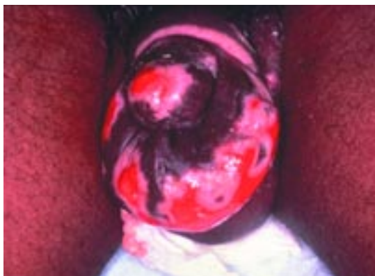
FIGURE 3. Herpes simplex virus lesion in a patient with human immunodeficiency virus infection.

A large variety of alternative medicines for herpes outbreaks are popular and are tout-