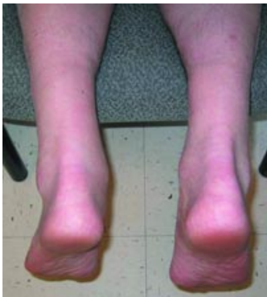
FIGURE 1. Xanthomas of the Achilles tendons. Note the position used for examination.

in heterozygous FH they can appear in young adulthood.