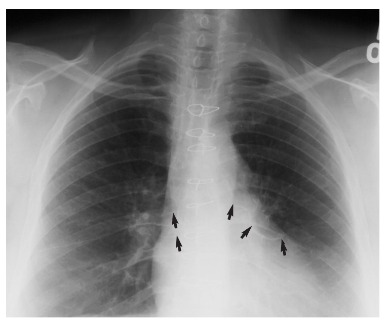
FIGURE 1. Plain chest radiograph, showing the fractured peripherally inserted central catheter (PICC) lodged in the left pulmonary artery (arrows).

PICCs have been used in clinical practice since 1982 in situations in which long-term circulatory access is needed (eg, for chemotherapy or total parenteral nutrition). They are relatively simple to insert, and the procedure is associated with few complications, the most frequent being pneumothorax (2%–6%), infection (2%–16%), thrombosis (2%–16%), catheter occlusion (2%), and leakage (1%–6%).