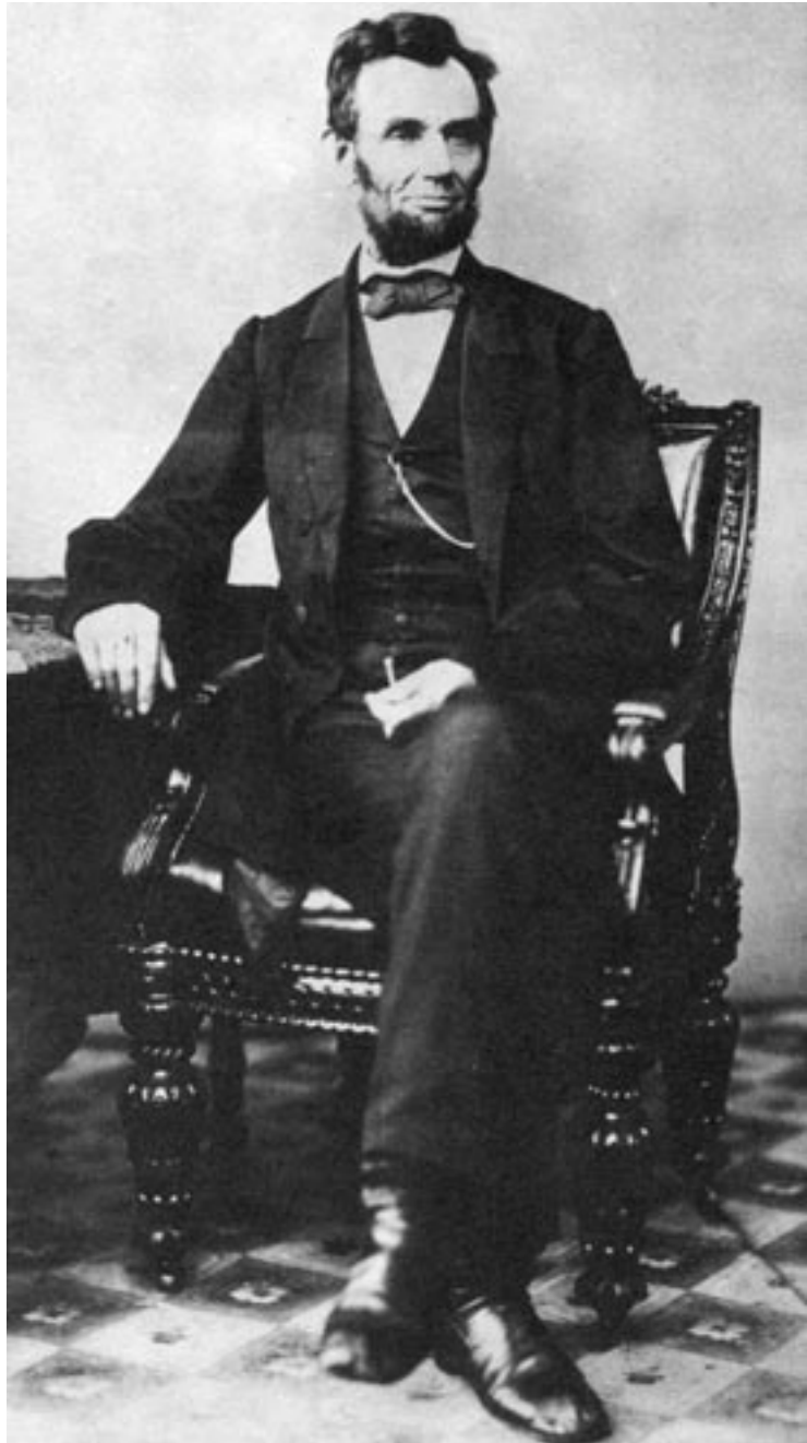
FIGURE 1. Some believe that the blurriness in Lincoln’s left foot in this photograph is due to excessive pulsation in the popliteal artery due to aortic regurgitation secondary to Marfan syndrome—the eponymous Lincoln sign.

PHOTOGRAPH BY ALEXANDER GARDNER, NOVEMBER 8, 1863.