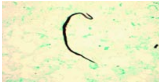
FIGURE 2. Strongyloides larvae in blood (Giemsa stain, oil immersion).

Upper gastrointestinal endoscopy is performed to evaluate her persistent nausea and