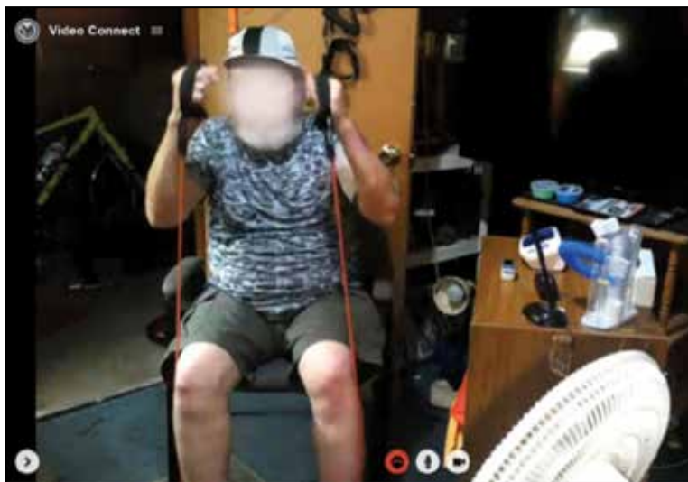
FIGURE 1 Remote Monitoring of a Patient Performing a Strengthening Exercise

(eg, adjusting volume and position of webcam). The patient is asked to set up a table close to the computer and to place all exercise apparatuses and respiratory devices on the table surface.