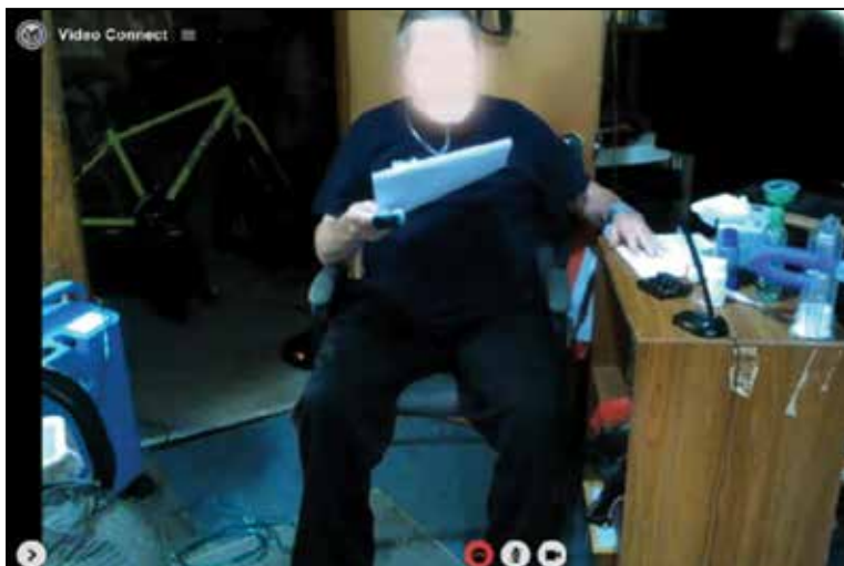
FIGURE 3 Telehealth-Based Patient Education

being manually guarded by the therapists. Risk of falls are a major concern due to impaired balance, poor vision, and other possible unusual physiologic responses to exercise (eg, drop in BP, dizziness, loss of balance). The area in front of the computer needs to be cleared of fall hazards (ie, area rug, wires, objects on the floor). The patient also needs to be educated on self-measurements of BP and oxygen saturation and reports to the therapists. The therapists provide detailed instructions on how to obtain these measures correctly; otherwise, the values may not be valid for a clinical judgment during the exercise session or for other clinical management. In a home environment, there is a limited use of exercise apparatuses. For this program, we only used resistance bands/tubes, small arm/leg ergometer, hand grip, and hand putty for the exercise program. We feel that dumbbell and weight plates are not suitable due to a possible risk of injury if the patient accidentally drops them.