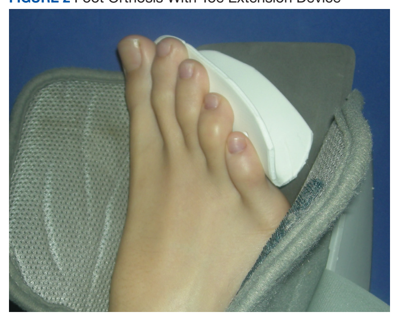
FIGURE 2 Foot Orthosis With Toe Extension Device

surgery was performed under IV sedation and an ankle block, using 17 minutes of tourniquet time.