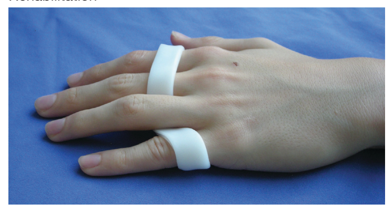
FIGURE 5 Yoke Splint for Hand Extensor Tendon Rehabilitation

divides into 4 separate tendons and is responsible for extending the 4 ulnar sided fingers at the metacarpophalangeal joint.<sup>10</sup>