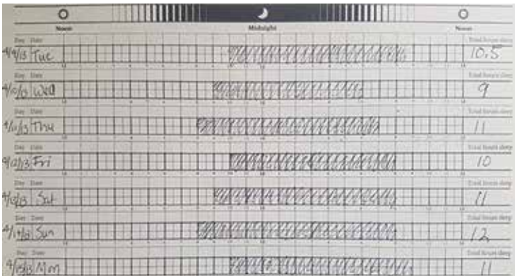
Figure 2. Sleep log from the patient in Figure 1 shows relatively good concordance between perceived sleep schedule and actual sleep schedule.