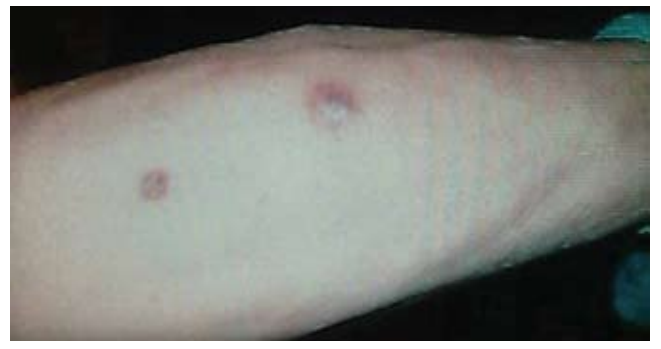
FIGURE 1. Purpuric nodules with surrounding erythema.

A 66-YEAR-OLD WHITE MAN presents with a 1-month history of two nontender, nonpruritic skin lesions on his leg 3 weeks after undergoing bilateral lung transplantation for idiopathic pulmonary fibrosis (FIGURE 1). Except for transient lymphopenia, the postoperative course has been uneventful, with no episodes of rejection. Immunosuppressive drugs include tacrolimus (Prograf) and steroids. He has a history of insulin-dependent diabetes mellitus, and no history of significant trauma to his legs. Other than the skin lesions, he feels well and has no systemic symptoms. He has no history of iron overload or deferoxamine (Desferal) therapy.