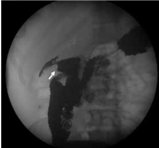
FIGURE 3. Upper gastroduodenography with oral contrast shows contrast leaking through the perforated duodenal ulcer (arrow).