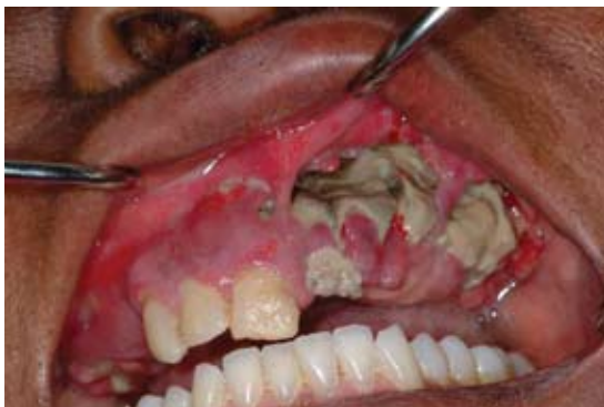
FIGURE 5. Osteonecrosis of the jaw.

REPRODUCED FROM RUGGIERO SL, MEHROTRA H, ROSENBERG TJ, ENGROFF SL. OSTEONECROSIS OF THE JAWS ASSOCIATED WITH THE USE OF BISPHOSPHONATES: A REVIEW OF 63 CASES. J ORAL MAXILLOFACIAL SURG 2004; 62:527-534, WITH PERMISSION FROM ELSEVIER. WWW.SCIENCEDIRECT.COM/SCIENCE/JOURNAL/02782391.