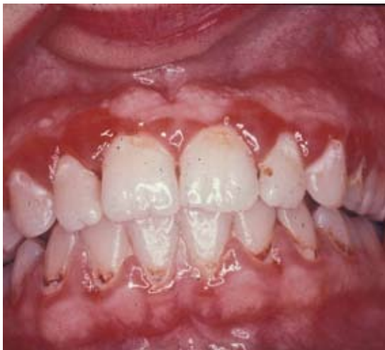
FIGURE 1. Red swollen gums of gingivitis.

If unchecked, gingivitis progresses to periodontitis, an inflammation of the supporting tissues of the teeth, including the gingiva, alveolar bone, and periodontal ligament (FIGURE 2). Periodontitis leads to progressive and irreversible loss of bone and periodontal ligament attachment, as inflammation extends from the gingiva into adjacent bone and ligament. Signs and symptoms of progressing periodontitis include red, swollen gums that may appear to have pulled away from the teeth, persistent bad breath, pus between the teeth and gums (FIGURE 3), loose or separating teeth, and the common complaint that “my teeth don’t fit together anymore.”