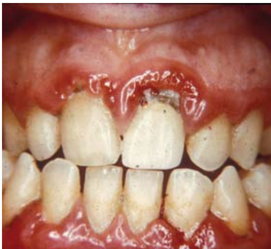
FIGURE 3. Red swollen gums with pus in periodontitis.

Norderyd et al, 23 in a cross-sectional study, found less periodontal disease in postmenopausal women who were on estrogen therapy than in those who were not, although the difference was not statistically significant.