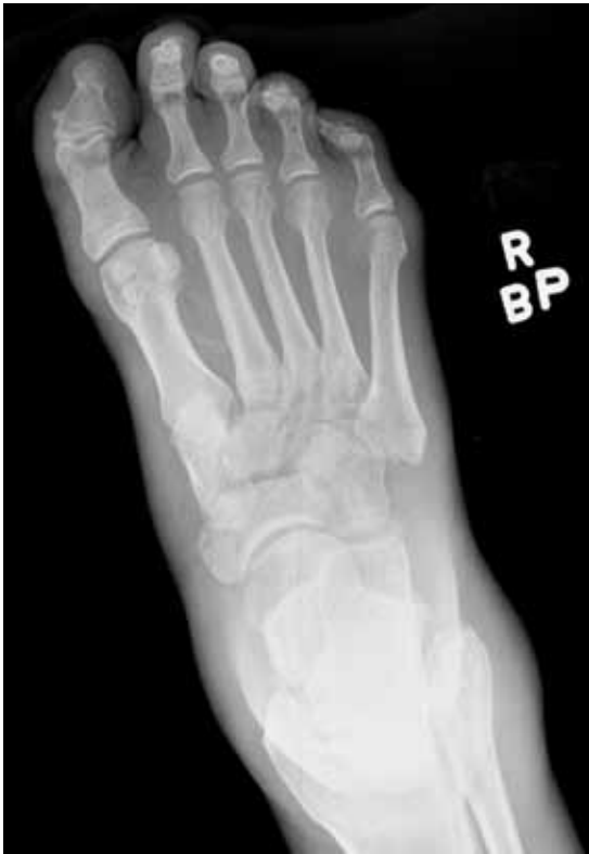
FIGURE 2. Stage 0. A plain anteroposterior radiograph taken in the emergency department shows no osseous abnormalities.