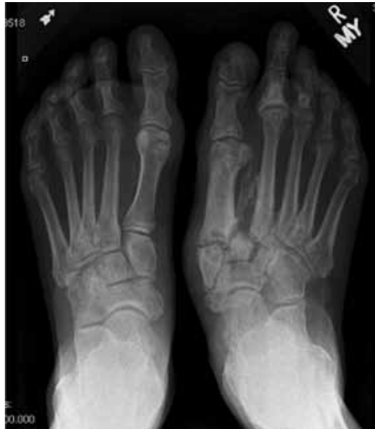
FIGURE 6. Stage 3. This plain radiograph shows the reconstruction stage with resolved edema, absence of osteosclerosis, and relative osteopenia. Also seen is healing of the fractures of the second and third proximal phalanges, the site of the ecchymosis on plain films in FIGURE 2 .

Radiography. Radiographic findings are important in diagnosing Charcot neuroarthropathy, although they are less helpful in patients with stage 0 disease, such as our patient, in whom the condition has not yet progressed to fracture or dislocation. All foot