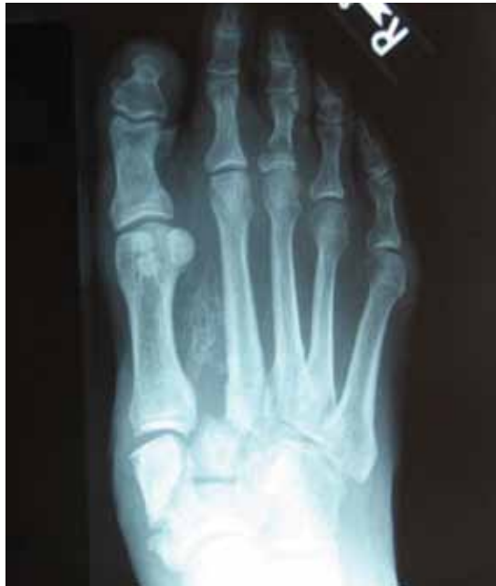
FIGURE 3. In this radiograph taken 3 to 4 months after the initial presentation, Charcot neuroarthropathy has progressed to stage 2 after delayed immobilization.

A radiograph in our patient ( FIGURE 2 ) taken during his initial emergency department visit