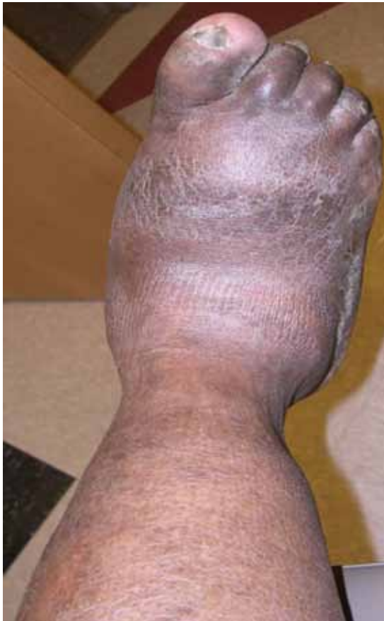
FIGURE 1. The patient's right foot at presentation.

He is 53 years old, with poorly controlled diabetes and peripheral neuropathy