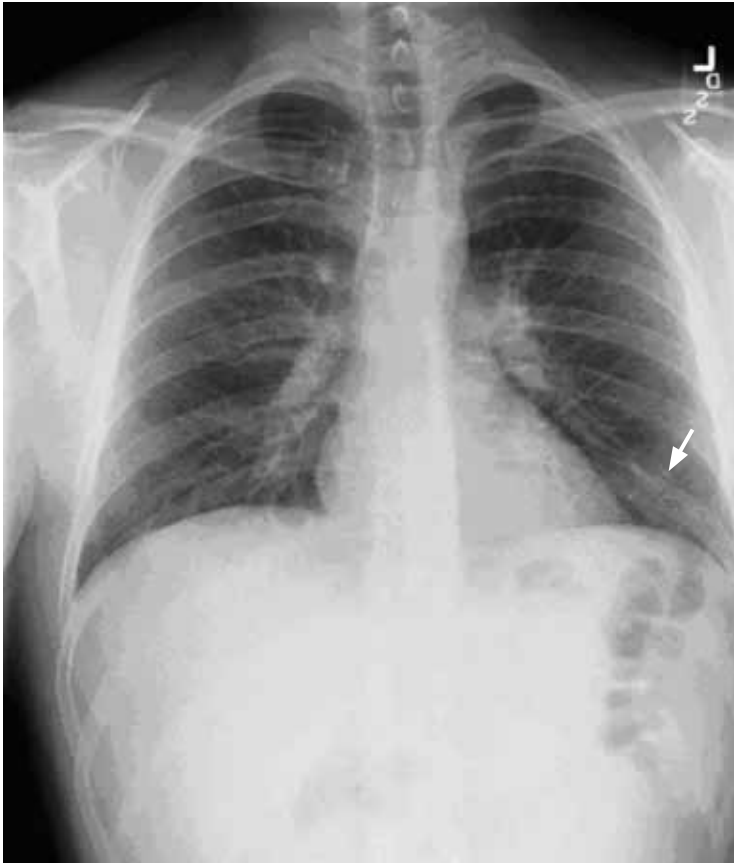
FIGURE 1. The patient's chest radiograph shows small atelectatic changes in the left lung base (arrow).