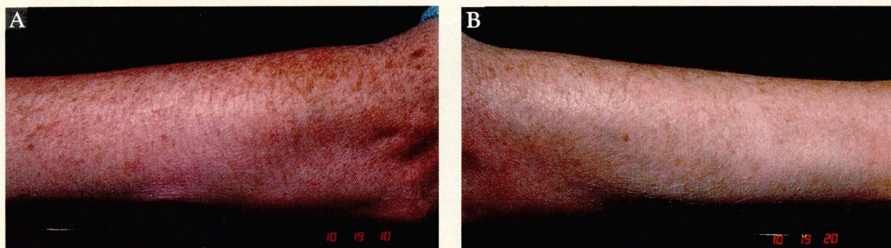
FIGURE 2. Placebo-treated left forearm (A) and tretinoin-treated right forearm (B) after 9 months of therapy with tretinoin emollient cream 0.01%. Note the difference in mottled hyperpigmentation and fine wrinkling.

showed improvement in overall severity by week 22. The earliest improvements were noted in roughness (median 12 weeks) and mottled hyperpigmentation (median 16 weeks).