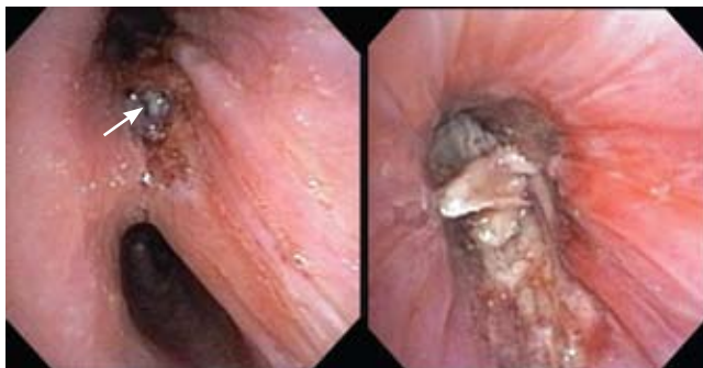
FIGURE 2. Left: bronchoscopic image at the level of the division of the right upper lobe and bronchus intermedius. A grey-white endobronchial lesion is seen in the right upper lobe. Right: Close-up of the fungating endobronchial lesion in the right upper lobe.