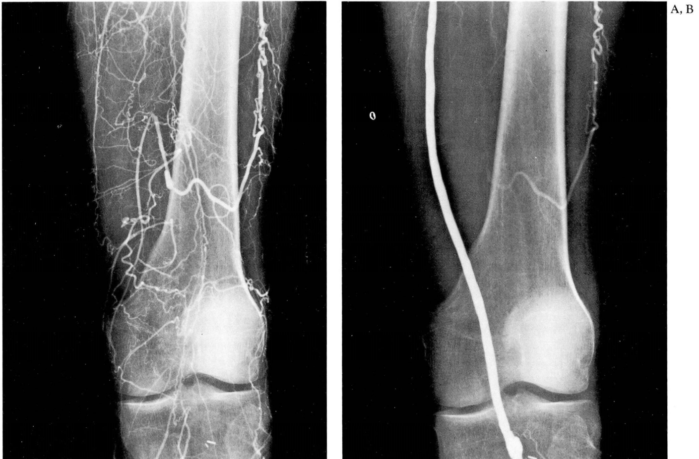
FIGURE 5A. Thrombosis of in situ saphenous-vein femoral-popliteal bypass. Note collateral from profunda femoris and poor distal reconstitution of vessels. FIGURE 5B. Patency of bypass is restored after four hours of t-PA administration. Stenotic distal anastomosis (not shown here) required revision to maintain patency of bypass.

thromboplastin time, or by clotable fibrinogen assay. With the exception of the latter assay, these methods are not very sensitive or specific. Furthermore, laboratory evaluation to establish presence of a lytic state does not indicate clot lysis or herald complications. 112,113 Laboratory analysis informs the clinician that the intended reaction of plasminogen activator is occurring. To determine whether clot lysis has occurred, the investigator must look for presence of circulating fibrin fragments including D-dimer and B-BETA 15-42 subunits. However, the levels of these fragments are of little value for clinical monitoring. Instead, we generally measure thrombin time, fibrinogen level, and hematocrit twice daily.