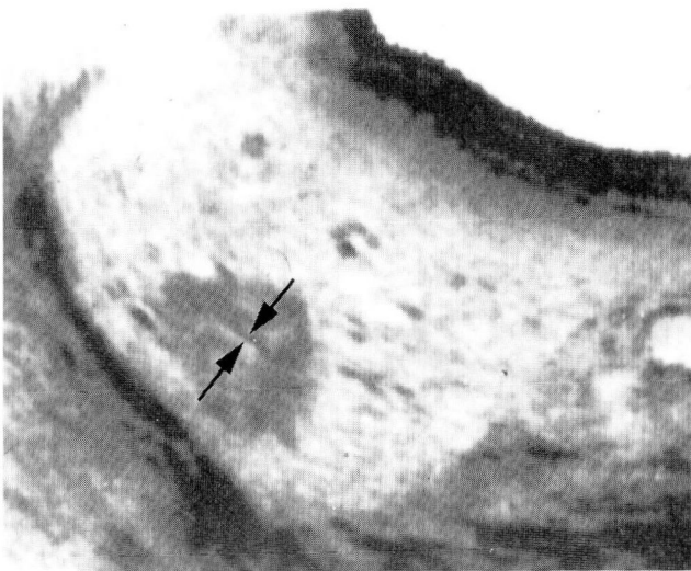
Fig. 3. Longitudinal ultrasound of the right lobe of the liver in a different patient. A well-circumscribed echogenic mass with a septum in its central portion is seen (arrows). Combination of these findings is diagnostic of a cavernous hemangioma. No further examinations were required in this asymptomatic patient.

On occasion, cavernous hemangiomas may be confused with malignant lesions. 3 In these cases, a CT scan is employed for further evaluation. If the CT study is made in the conventional manner, the results will be incomplete or may miss the lesion entirely. A dynamic technique is necessary to evaluate the flow of medium as it traverses the lesion and the surrounding tissue. In 70% of cases, cavernous hemangiomas will fill in from the periphery, often with densely enhancing