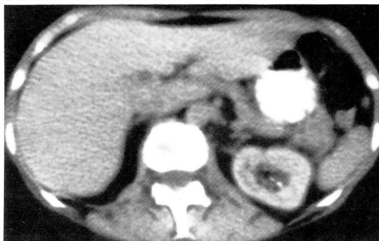
Fig. 2. Serial CT scans of the same section of the liver.