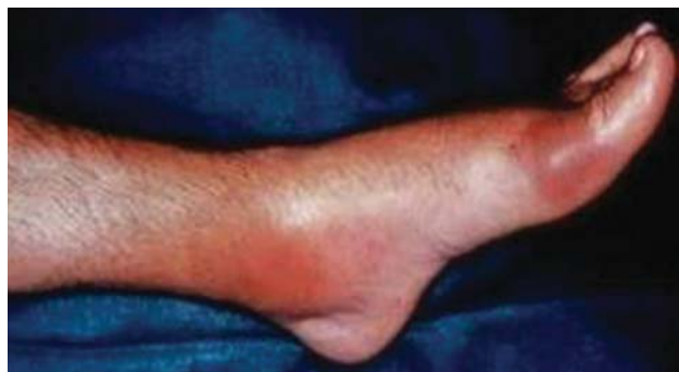
FIGURE 2. Swollen, erythematous ankle and first metatarsophalangeal joints during an acute attack of gout.

Certain medications have been associated with hyperuricemia, including cyclosporine and thiazide diuretics. 9 If a patient has been taking one of these medications, gout should be considered in the differential diagnosis if