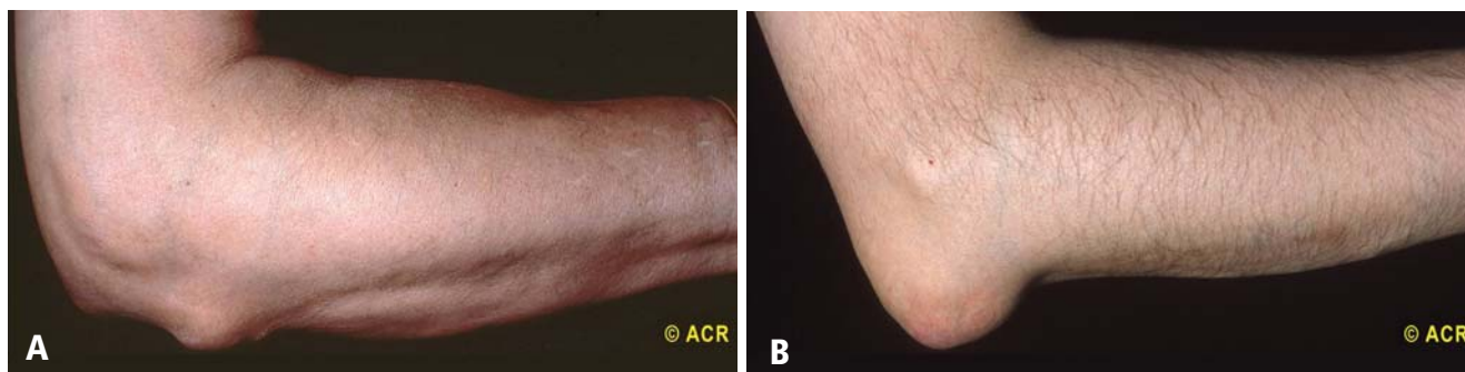
FIGURE 3. (A) Rheumatoid nodules are firm and usually not movable but rather are attached to the extensor surface of the forearm. (B) Tophi appear as firm, gritty particles in the olecranon bursa.