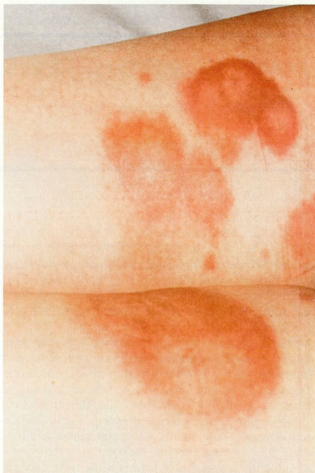
FIGURE 2. Erythema chronicum migrans involving the legs. Note the annular borders, central clearing, and satellite lesions.

Other manifestations of myocardial involvement may include mild and reversible left ventricular dysfunction,