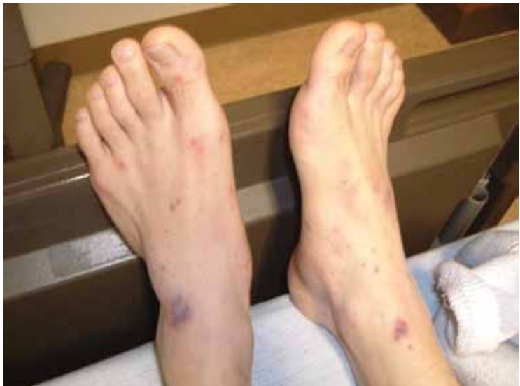
FIGURE 1. Petechial rash from Neisseria meningitidis .