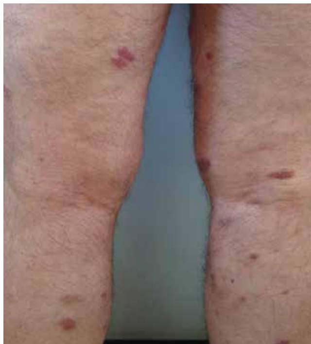
FIGURE 1. The poorly demarcated erythematous plaques had infiltrated the skin on the arms and legs.

A 70-YEAR-OLD MAN presented with multiple erythematous plaques on the arms and legs ( FIGURE 1 ). The plaques had infiltrated the skin and were poorly demarcated.