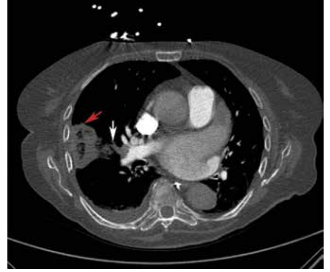
FIGURE 2. Computed tomography of the chest showed acute thromboembolism in the right interlobar artery (white arrow) and a wedge-shaped consolidation in the right-middle lobe (red arrow), consistent with pulmonary infarction.

At the time of admission, she had no fever, cough, orthopnea, or leg swelling. Her physical activity was restricted, with residual right-sided weakness after her stroke. Her heart rate was 125 bpm; her oxygen saturation level was 98% on 2 L of oxygen per minute via nasal cannula. She had an irregularly irregular rhythm, a jugular venous pressure of 7 cm H_2O , and no cardiac murmurs. Lung sounds were reduced at the bases, with faint crepitations.