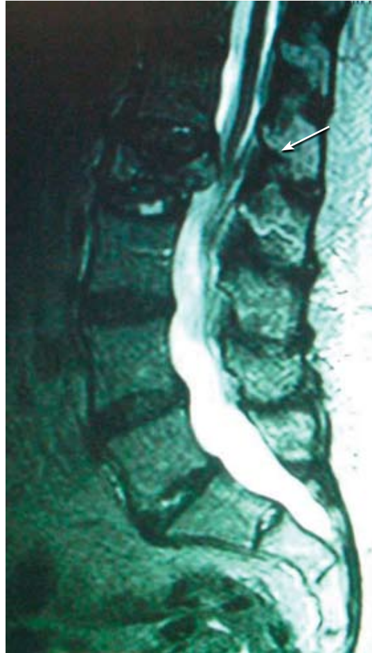
FIGURE 2. A 63-year-old woman with history of hepatocellular carcinoma who presented with bilateral leg weakness and debilitating back pain. T2-weighted MRI shows pathologic compression fracture of the L2 vertebral body with retropulsion of fracture fragments into the canal and severe central canal stenosis (arrow).

The ESR and CRP are almost always elevated with systemic neoplasia