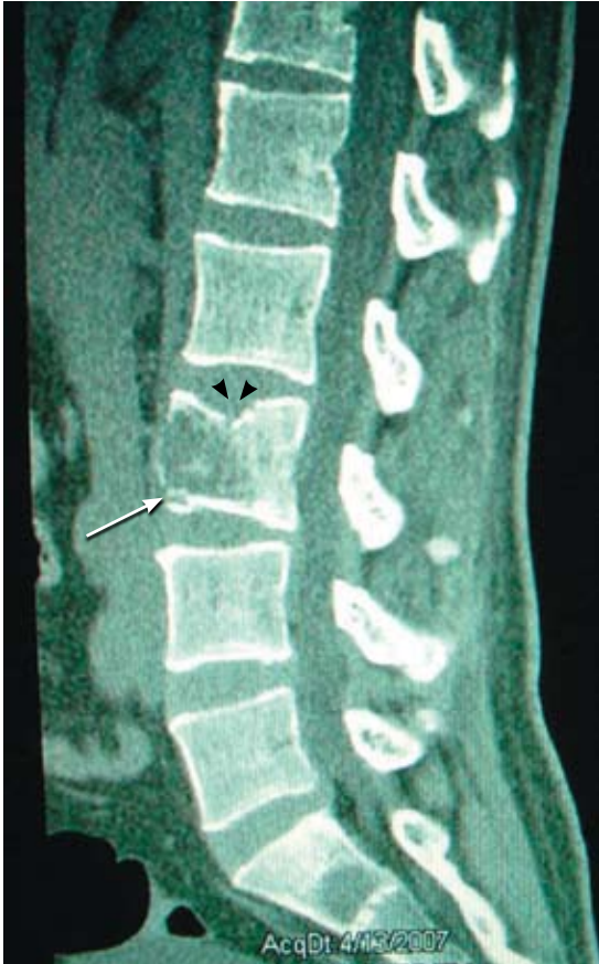
FIGURE 1. A 43-year-old man with a 2-week history of progressive back pain and an abdominal mass. Sagittal CT scan shows an osteolytic lesion of the L3 vertebral body (arrow). The primary tumor was renal. Fracture of the vertebral end plate (arrowheads) may cause first symptoms of pain.

mal reflexes. Signs or symptoms of spinal cord compression should be investigated immediately.