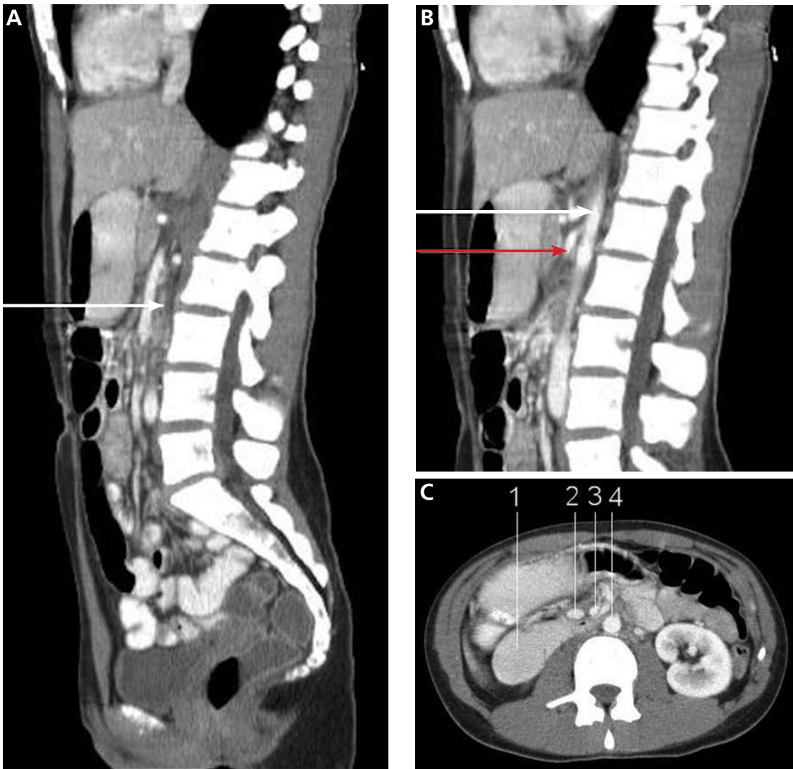
FIGURE 1. A , sagittal CT with contrast shows the duodenum (arrow) compressed under the superior mesenteric artery (SMA). B , CT shows the narrow angle formed by the SMA (red arrow) and the aorta (white arrow). C , axial CT shows the duodenum (1) compressed between the SMA (3) and the aorta (4). Also seen are the superior mesenteric vein (2), decreased fat around the SMA, and the decreased distance between the SMA and the aorta.

On endoscopy, the second and third portions of the duodenum were narrowed, with prominent pulsations