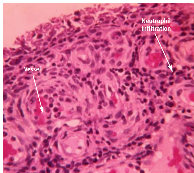
FIGURE 1. Synovial tissue of a patient with acute gout. Note the dilated vessels, representing the throbbing, hot, erythematous joint, and the large numbers of neutrophils.

sites of trauma or irritation. The first metatarsophalangeal joint is often affected, at least in part because it is a site of mechanical stress. Likewise, mechanical irritation from leaning on the elbow may cause crystals to deposit in the olecranon bursa.