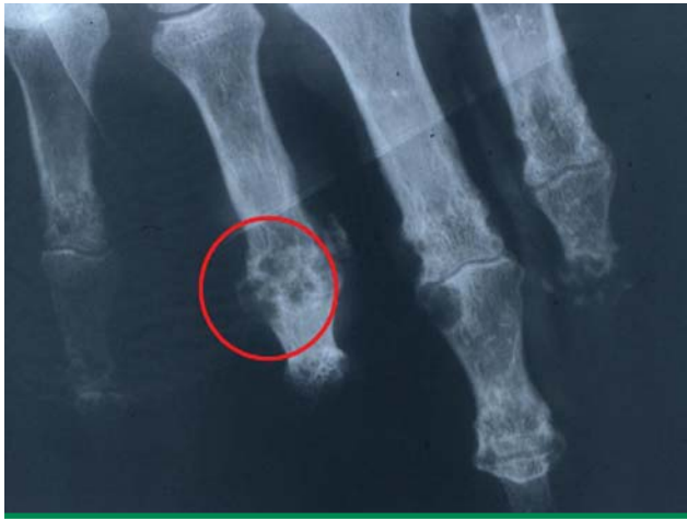
FIGURE 3. Large, cystic joint erosions producing an overhanging edge (circled area) characteristic of chronic gouty arthritis.

key point is that low-grade inflammation persists and crystals remain in the joint, which can lead to progressive disease. 14