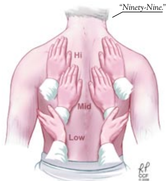
FIGURE 2. Tactile fremitus—the examiner asks the patient to say specific words repeatedly (eg, “ninety-nine”).

Signs of pleural effusion that can be detected by palpation include asymmetric chest expansion and asymmetric tactile fremitus.