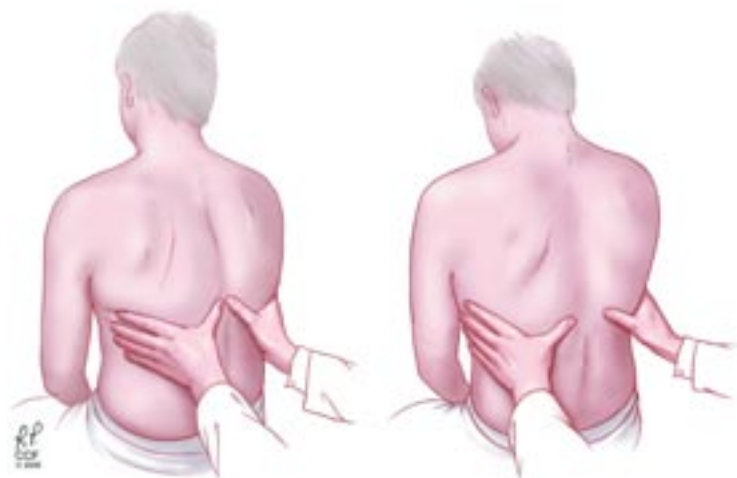
FIGURE 1. Palpation to detect asymmetry of chest expansion, a sign of pleural effusion.

TABLE 3 shows some of the common physical findings, depending on the amount of pleural fluid present.