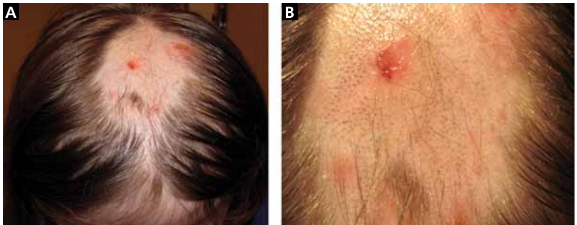
FIGURE 1. An irregular patch of alopecia (A) with small crusted areas. Close examination reveals broken hairs and areas of excoriation (B).

A 12-YEAR-OLD GIRL has a large, irregular area of hair loss over the central frontoparietal scalp. Physical examination reveals scattered short hairs of varying lengths and a few small crusts throughout the area of alopecia (FIGURE 1). The remainder of the scalp appears normal.