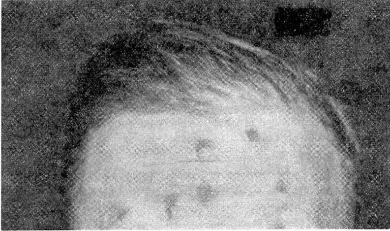
FIGURE 2, CASE 1: Dull red, smooth cutaneous nodules on forehead. There were similar lesions on the upper lip and chin.

referring physician reported that the eruption had disappeared after a few injections of mapharsen and that there had been no mucocutaneous relapses. A recent report on the blood serology was not available, but the patient was still under treatment and was cooperating satisfactorily.