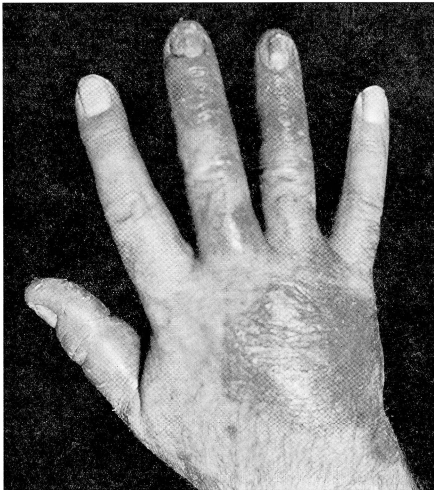
FIGURE 3, CASE 2: Large, squamous plaque on dorsal surface of the hand. Syphilitic onychia of nails of ring and middle fingers.

There were large, flat, scaly papules on the back and upper extremities.