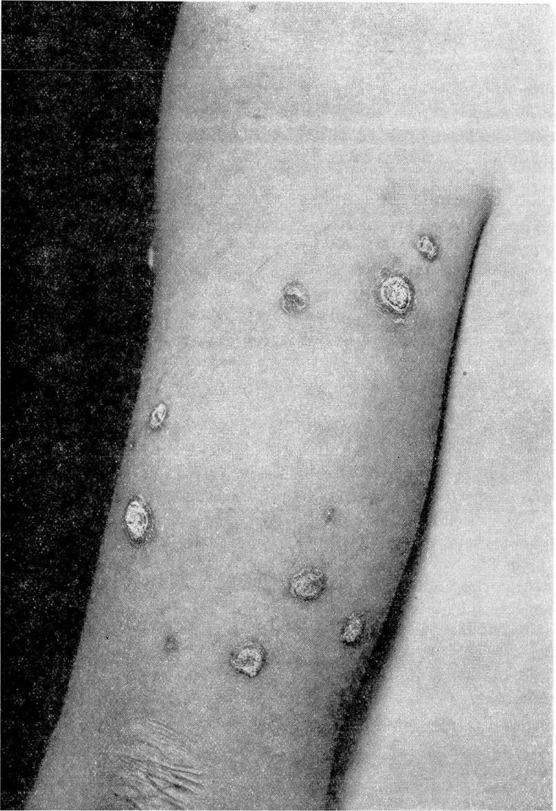
FIGURE 1, CASE 1: Psoriasiform syphilids. Note the collarette of loose epithelium at periphery of the lesions.

early syphilis. The arsenical which had been administered (probably neoarsphenamine) was ineffective; therefore, mapharsen was selected as the arsenical to be used and the heavy metal therapy was to consist of intramuscular injections of bismuth salicylate.