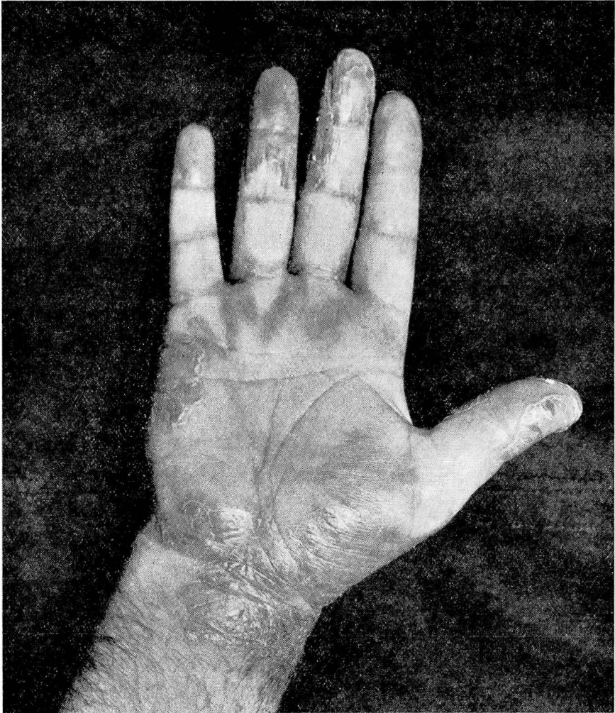
FIGURE 4, CASE 2: Infiltrated squamous plaque on wrist and palm. Note collarette of loose epithelium at margins of the lesions.

A biopsy of one of the papules on the back showed a chronic inflam-