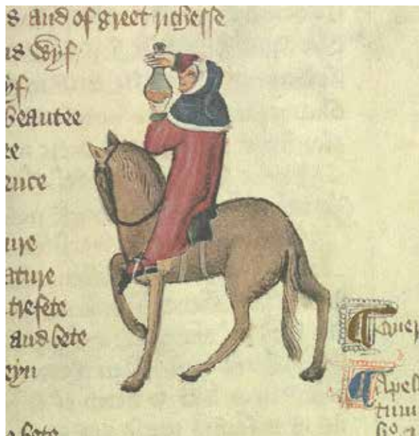
FIGURE 1. Urinalysis on horseback. From the Physician’s Tale in the Ellesmere manuscript of Geoffrey Chaucer’s Canterbury Tales , c. 1400.

Gilles de Corbeil in the 12th century wrote a poem on judging urine, intending it as an aid for remembering the supposed 20 different diagnostic colors of urine and describing in detail the use of the urine flask, a bladder-shaped container for studying the