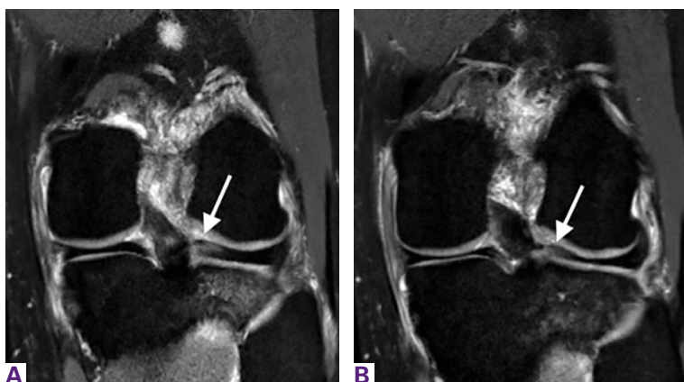
Figure 1. 3T magnetic resonance imaging T2 weighted coronal sections showing (A) lateral meniscus posterior horn and root with increased signal and underlying tibial bone edema at tip of white arrow and (B) radial tear extending full thickness at the posterior horn and root at the tip of the white arrow.

The gold standard for diagnosis of a meniscal root lesion is under direct visualization during arthroscopy. 18 The meniscal roots must be probed and stressed to assess their integrity regardless of the initial indication for knee arthroscopy. In most cases, however, the diagnosis of meniscal root tears should occur prior to proceeding to the operating room.