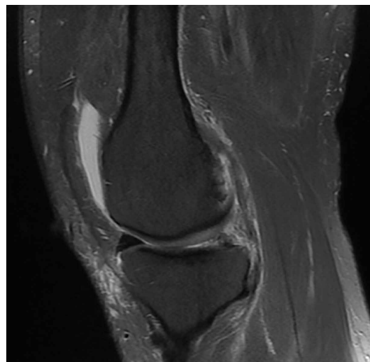
Figure 3. On magnetic resonance imaging, when the anterior horn is present, but the posterior horn is not visualized, it is termed a “ghost meniscus.” This finding is highly associated with meniscal root tears.