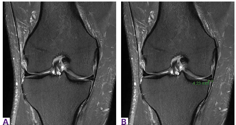
Figure 2. Most often seen with the medial meniscus, extrusion is diagnosed when the meniscal body displaces greater than 3 mm past the tibial articular surface on a midcoronal image.

Patients who have meniscal root tears that are likely sequelae of an arthritic process are not candidates for meniscal root repair. These patients will often have known arthritis with an intact meniscus and then progress to menis-