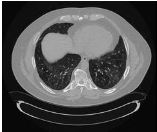
FIGURE 1. The patient's computed tomographic scan. Left , axial image through the base of the lungs before treatment. Right , after treatment.

A 50-YEAR-OLD man presents with dyspnea on exertion and fatigue that began a year ago and gradually worsened. Associated symptoms include productive cough, fever, and arthralgias in his hands, knees, and shoulders. He also reports muscle weakness with activities such as climbing stairs. Findings on physical examination are normal except for erythematous, thickened, and fissured skin on the dorsal surface of the hands, bibasilar rales, and proximal muscle weakness (his strength is rated 4 on a scale of 5). Computed tomography (CT) of the chest is ordered ( FIGURE 1 ).